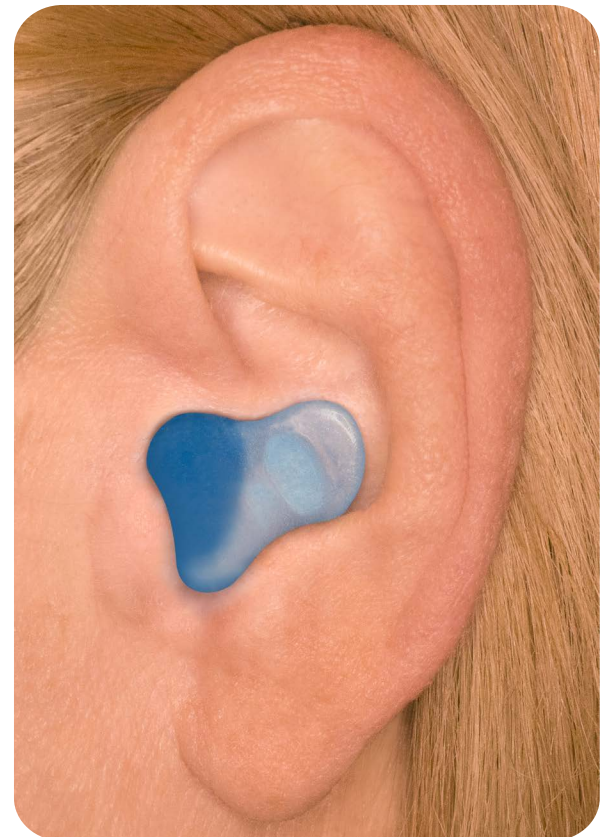
A low profile and a soft material make the Sleep Plug Plus™ comfortable for sleeping, even when lying on your side — you'll forget you're wearing them!

A filtered option reduces loud noise while allowing more sound to enter the ear canal. Ideal for noisy environments where the user may want some noise reduction with more situational awareness, like sporting events, restaurants, and concerts.